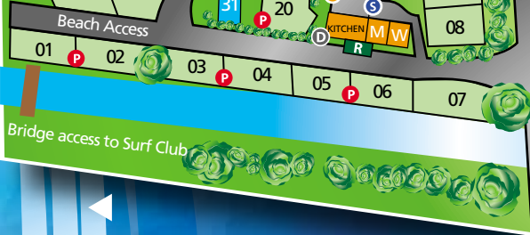
Surf Club & North End.